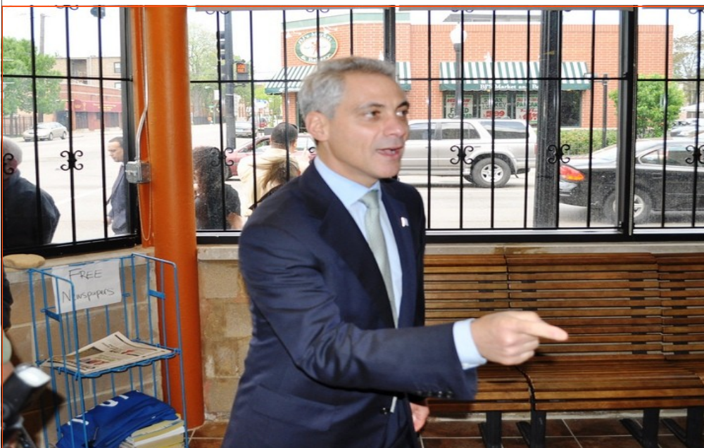
Mayor Rahm Emanuel enters the Greater Auburn-Gresham Development Corporation's (GADC) headquarters in Auburn Gresham during his first 100 days as Mayor of Chicago.

As Chicago's newest serving chief executive officer, Mayor Rahm Emanuel, reached his first 100 days in office by hiring a new police superintendent and a new schools chief. He announced new jobs to the Chicago area, reassigned 500 police officers to street beats and pledged to reassign 500 more police officers, and work with grocery chains to end food deserts in hard pressed communities.