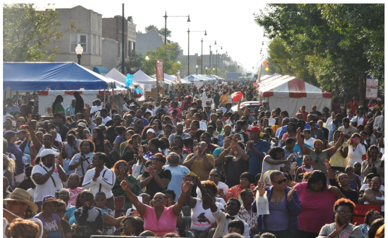
An estimated 10,000 people attended the 6th Annual Auburn Gresham 79th Street Renaissance Festival & St. Sabina Family Peace Jam.