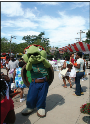
Tommy, the IDOT Turtle, gives a shout out at the 79th St. Fest.