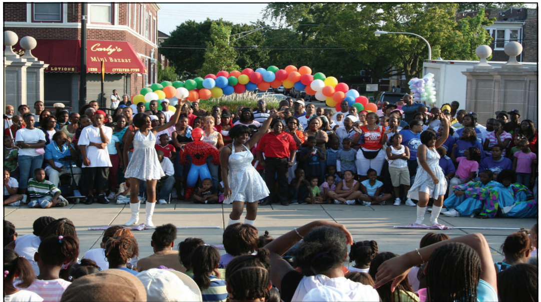
The ladies of the South Shore Drill Team perform to the sounds of Motown classics for hundreds of 79th Street Renaissance Festival goers.