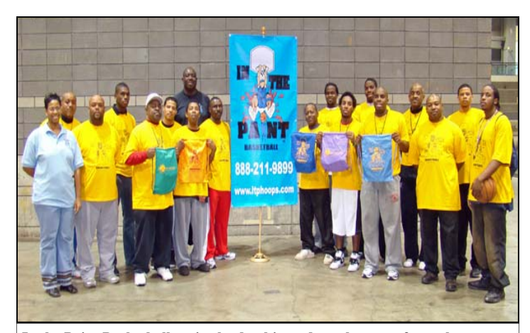
In the Paint Basketball senior leadership and coaches pose for a photo at McCormick Place.

n The Paint Basketball (ITP) participated in the City of Chicago's - 2008 Holiday Sport's Festival at McCormick Place, December 27-29, 2008. This holiday sports festival hosted more than 50 sports with approximately 100,000 youth in attendance. The Mayor's Office of Spe-