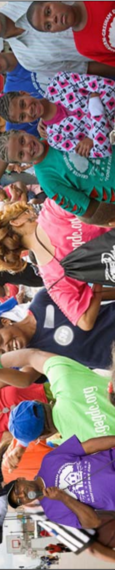
Last September 2008 an estimated 7,000 people made their way to the rejuvenated 79th Street corridor to browse vendor displays, enjoy live entertainment, and sample food from local restaurants. It was a beautiful sun-kissed day in the heart of the Auburn-Gresham community, and with over 100 vendors represented at the festival, there was something for everyone.