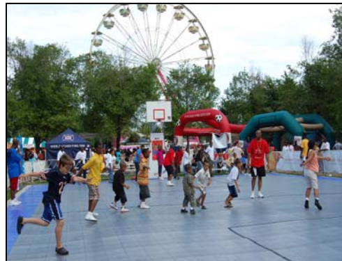
Hundreds of thousands of festival-goers (top) attended the 29th Annual 10-Day Taste of Chicago in historic Grant Park in downtown Chicago. Those local entities that participated include: BJ's Market & Bakery (10th year-middle left), Lagniappe Creole Cajun Joynt (4th year-middle right), Soul Vegetarian Restaurant (2nd year-bottom left) and newcomer, In The Paint Basketball (bottom right).