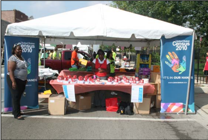
U.S. Census Partnership Specialists distribute materials regarding the 2010 Census at the 79th Street Renaissance Festival.

The Greater Auburn-Gresham Development Corporation (GADC) recently partnered with the United States Census Bureau to distribute vital information regarding the 2010 Census.