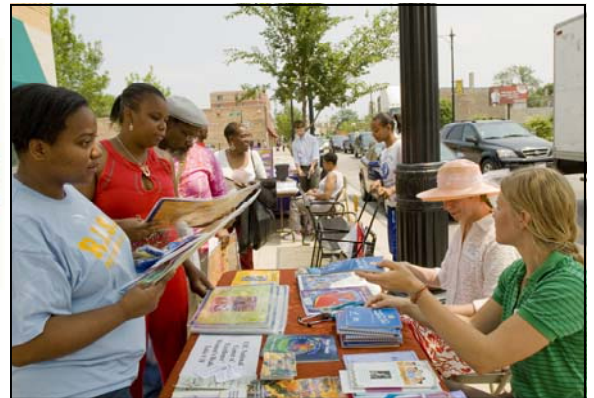
The Greater Auburn-Gresham Development Corporation (GADC) in collaboration with Atlantic Philanthropies' Elev8 initiative at Perspectives-Calumet Middle School, held its 3rd Health Fair on the Block on 79th Street, bustling with lots of activity and excitement. Thirty-six organizations set up tables to talk about important health issues and a variety of health-related resources available to community members.