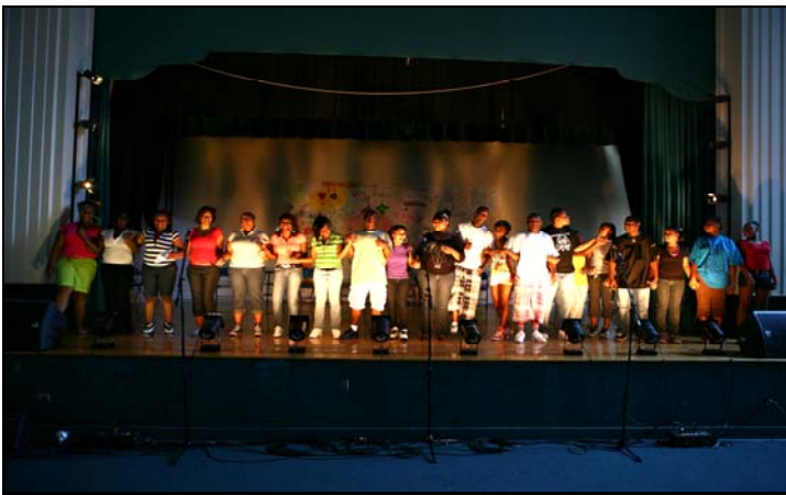
High School from Auburn Gresham and neighboring communities performed their final theatrical production of an international exchange play titled, "You Feel Me?" This play showcased the student's ability to produce a range of arts including audio, film, visual, and written.

Aligning itself with Auburn Gresham's Quality of Life Plan to make enjoyment of the arts and culture a way of life, The Greater Auburn-Gresham Development Corporation (GADC) partnered with Urban