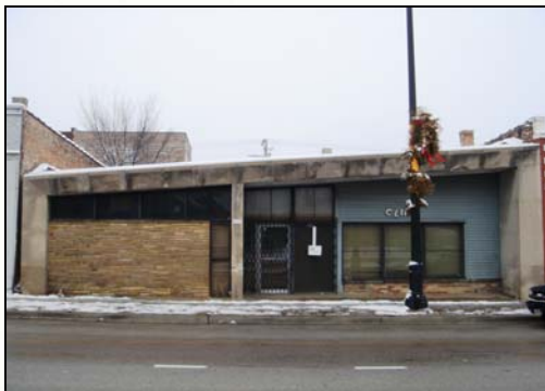
Dr. Selvam Medical Offices located at 946 W. 79th Street (BEFORE)

The Greater Auburn-Gresham Development Corporation (GADC) partnered with the City of Chicago to encourage business owners to participate in the City' Façade Re-