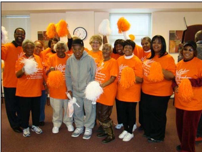
Senior citizens participating in Stanford University's leadership chronic disease workshop cheer themselves for completion of the course. They were acknowledged at a health and wellness rally at the Auburn Gresham Senior Satellite Center.

Committed to aging successfully, 16 senior citizens participated in a 6-week leadership chronic disease workshop (developed by Stanford