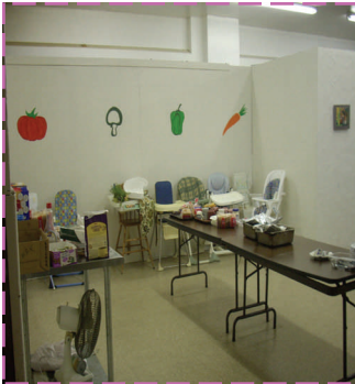
The Dining Area