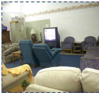
The Living Room