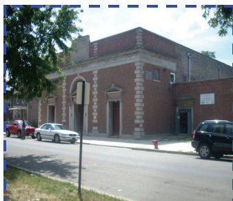
The Senior Center