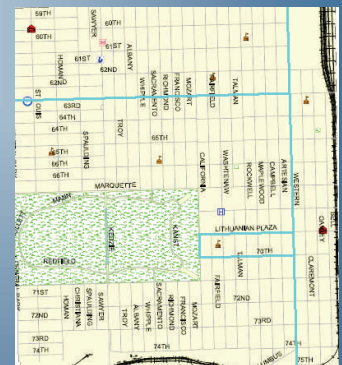
The boundaries of the Chicago Lawn Community.

cago Lawn community is a wonderful thing because of all the beautiful houses the parks, but the outer beauty does not reflect the inner unhealthy conditions of the community.