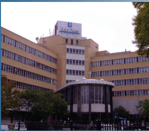
The office of healthy Chicago Lawn

The main reason of bringing the health fair came into auburn Gresham was to promote health in wellness in the community.