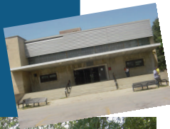
FOSTER PARK FIELD HOUSE