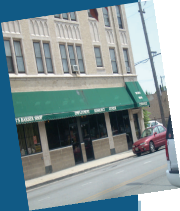
EMPLOYMENT RESOURCE ON RACINE AVENUE

THE EMPLOYMENT RESOURCE CENTER WAS FOUNDED IN 1998 TO SERVE THE JOB SEEKING NEEDS OF THE AUBURN GRESHAM AND ENGLEWOOD COMMUNITIES. AT THE EMPLOYMENT RESOURCE CENTER,